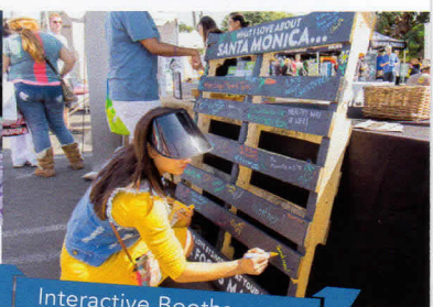
Interactive Booths with lots of Give-a-ways!

This FREE EVENT for all ages brings together our local businesses and non-profits for a fun-filled day while raising awareness about the economic, environmental and community benefits of buying local first!